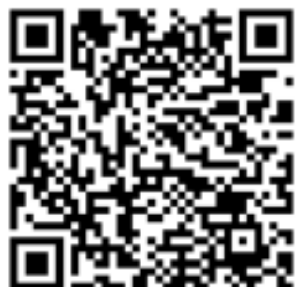
LUMC Online Offering

(O Hawai'i, O sands of my birth, My native home. I rejoice in the blessings of heaven, O Hawai'i, aloha. Happy youth of Hawai'i, Rejoice! Rejoice! Gentle breezes blow. Love always for Hawai'i.