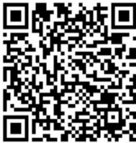
LUMC Online Offering

(O Hawai'i, O sands of my birth, My native home. I rejoice in the blessings of heaven, O Hawai'i, aloha. Happy youth of Hawai'i, Rejoice! Rejoice! Gentle breezes blow. Love always for Hawai'i.