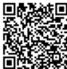
LUMC Online Offering

(O Hawai'i, O sands of my birth, My native home. I rejoice in the blessings of heaven, O Hawai'i, aloha. Happy youth of Hawai'i, Rejoice! Rejoice! Gentle breezes blow. Love always for Hawai'i.